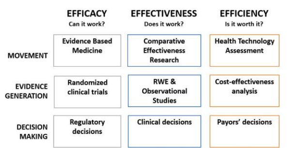
Fig. 1. Methods to assess the efficacy, effectiveness and efficiency in the decision-making process. RWE: Real world evidence.

Regulatory trend towards conditional drug approvals [1], or the expo- nential development of a technology that facilitates the analysis of real-life data [2], should provide a new impetus to a specialty